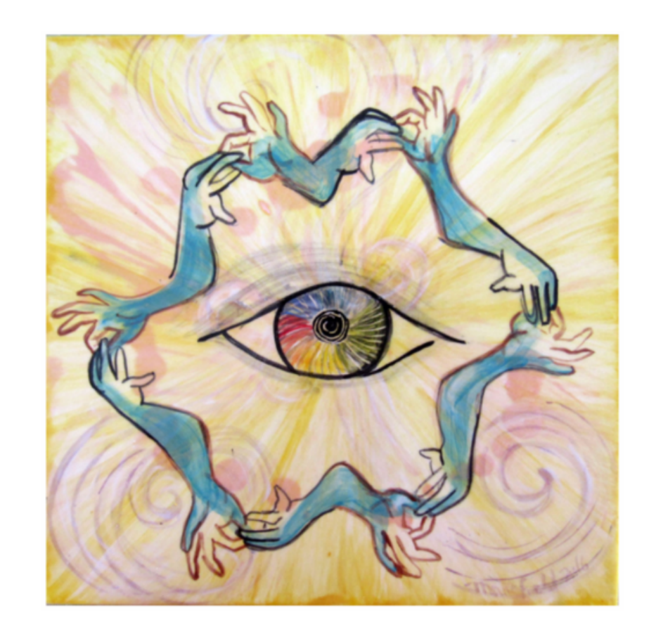
Reflect, Connect, Grow