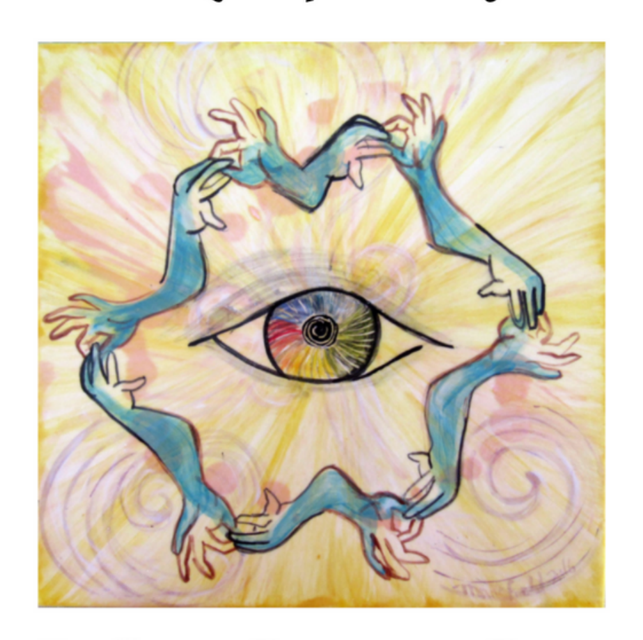
Reflect, Connect, Grow

General: $30.00 Deaf: $20.00 Student Members: $20.00 Region II Conference Participants: Free