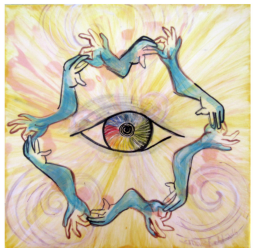
Reflect, Connect, Grow

General: $30.00 Deaf: $20.00 Student Members: $20.00 Region II Conference Participants: Free