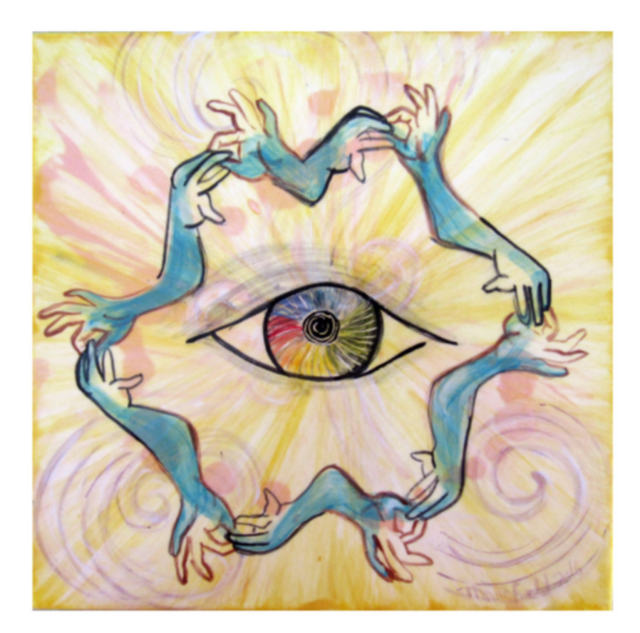
Reflect, Connect, Grow

General: $30.00 Deaf: $20.00 Student Members: $20.00 Region II Conference Participants: Free